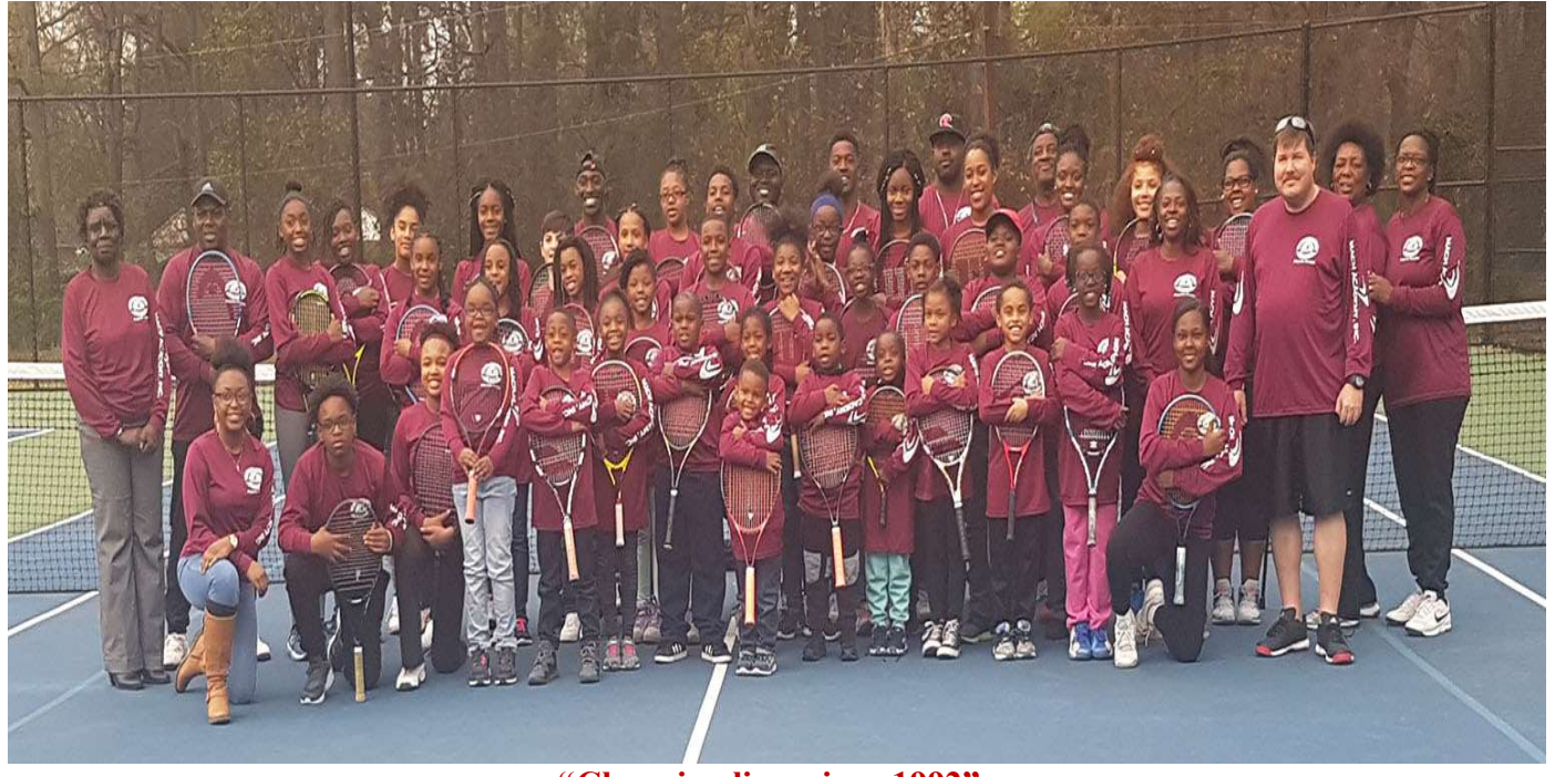
"Changing lives since 1992"

Program Hours: After School Monday-Friday 3:30 p.m. - 8:00 p.m. Masters Week Camp (Spring Break): Monday - Friday 9:00 a.m. - 5:00 p.m. Summer Camp Sessions (June and July) Weekly, Monday - Friday 9:00 a.m. - 5:00 p.m. Office Hours: Monday - Friday 11:00 a.m. - 6:00 p.m.